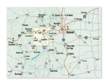
10th Mountain Hut System is in central Colroado between Crested Butte, Aspen, Vail, Breckenridge, and Winter Park.